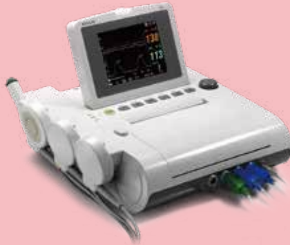
F3 Fetal Monitor